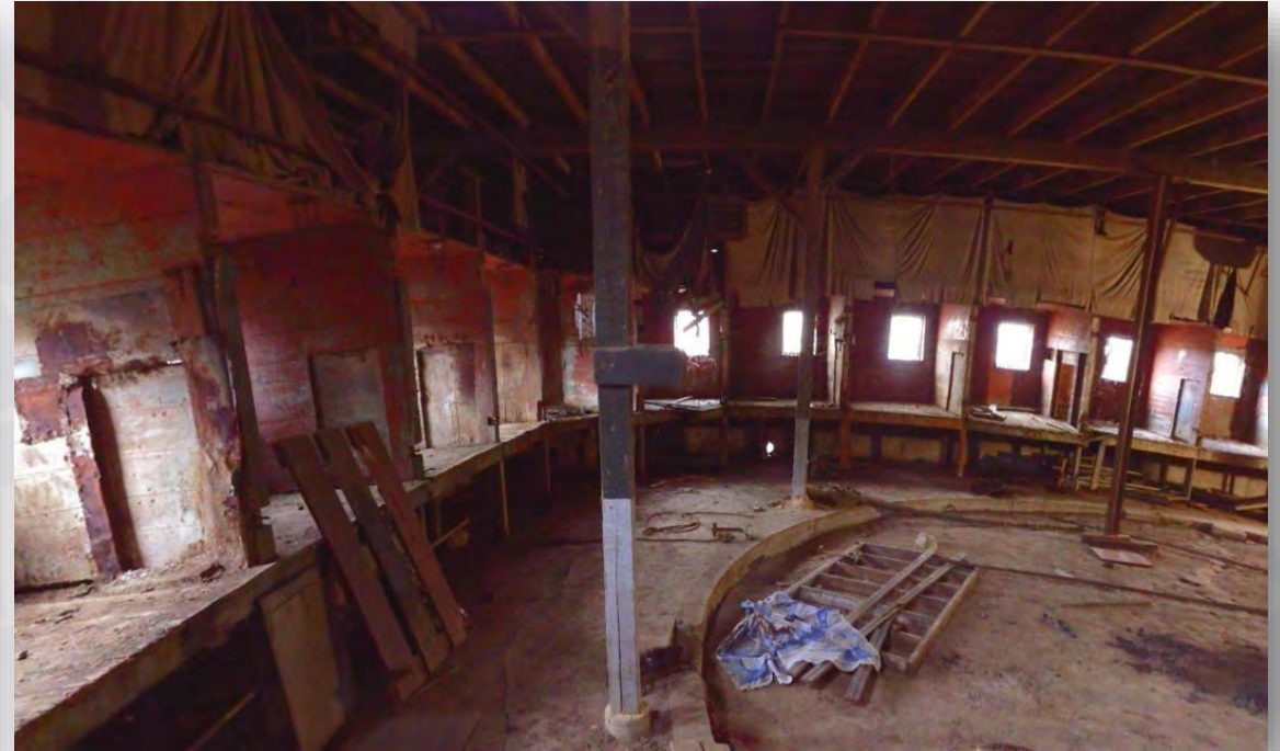
Cat Barn Tour